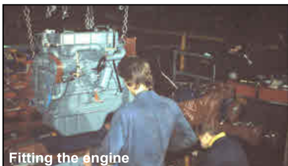
Fitting the engine

A short walk across to 'C' block then took us past hydraulic unit, gearbox and half axle assembly. Before arriving at the production line we would watch the engines being fitted out with their clutches, clutch shafts and various other small components.