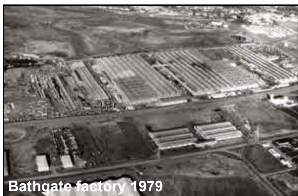
Bathgate factory 1979

Nuffield and Leyland Tractor production took place at the Leyland Truck and Bus factory at Bathgate, West Lothian, Scotland. Many of the components required to build the tractor were produced 'In house'. The factory was arranged into five 'Blocks' 'A', 'B', 'C', 'D' & 'E'